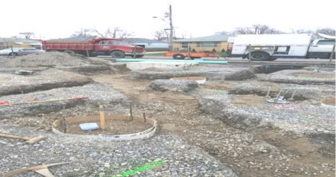
APRIL, 2019 WATER SUPPLY & DRAINS JUNE, 2019 NEW CONCRETE & FENCE