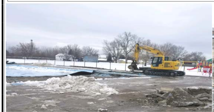
NOVEMBER, 2018 POOL DEMOLITION JUNE, 2019 FINAL INSTALLATION